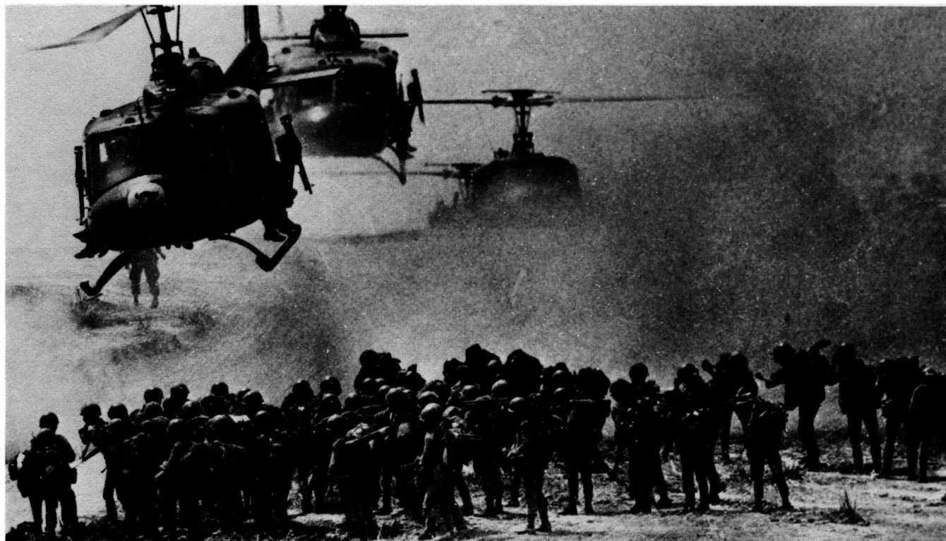
Satan's attitude of rebellion and hatred has caused man to pursue the way of war and death.

Some time after Satan was given power over